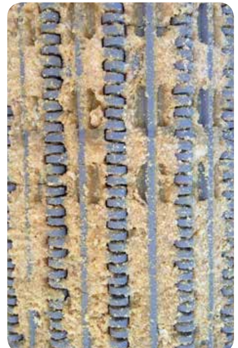
Bottom side of a modular belt