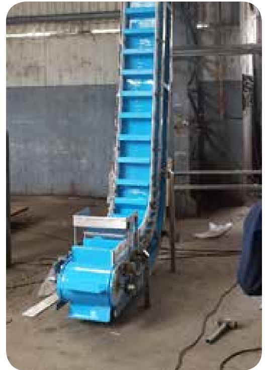
Fixed conveyor side wall

In order to match the throughput capacity of an existing bucket elevator (or indeed to plan a new one in a projected factory layout) a number of key factors are taken into account.