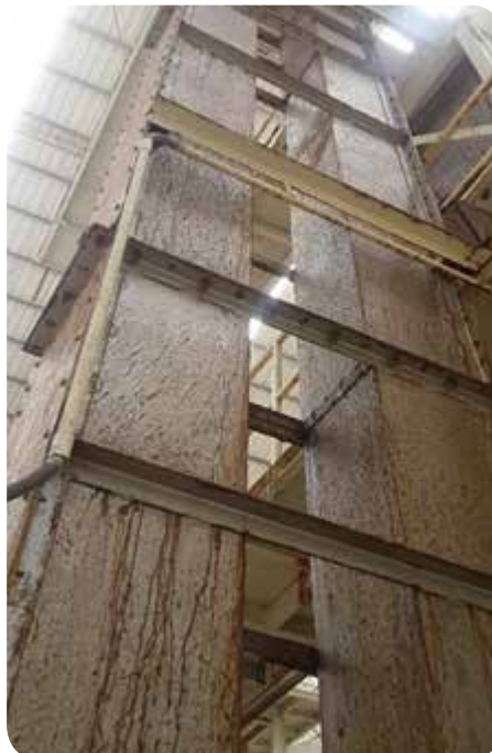
Closed system - cannot be cleaned