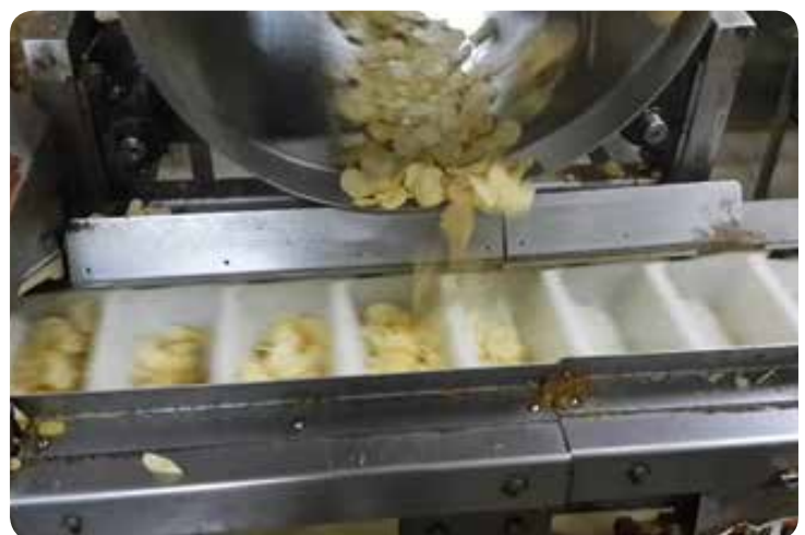
Chain driven continuous buckets shown at infeed in the snacks industry