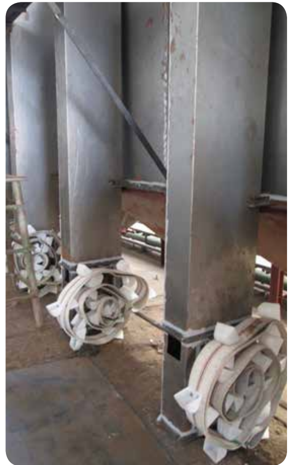
A battery of friction driven bucket elevators used in elevating tea leaves