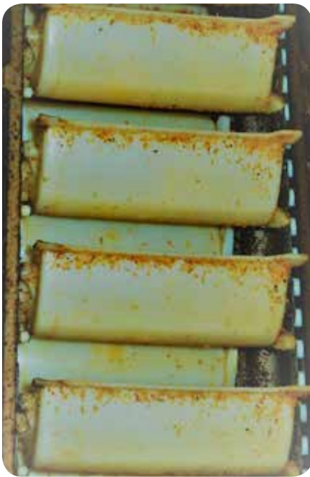
Open chain contaminated by food soil