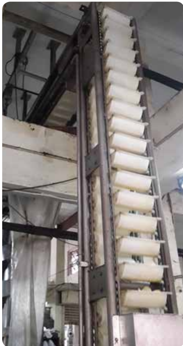
Vertical and second horizontal sections used in elevating cereals

Vertical elevators are commonly used in the tea industry, as well as cereal, coffee, cocoa powder, salt and other bulk applications, both in the food industry and elsewhere.