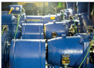
Online monitoring of motor and pump