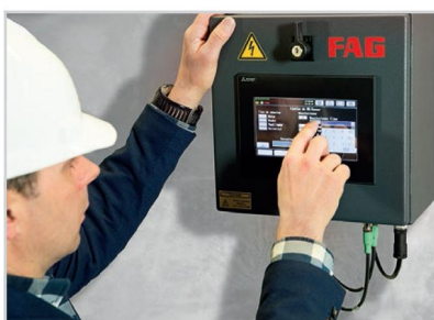
Display on touch panel